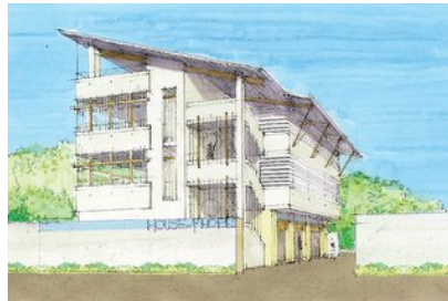
Artists rendering of completed clinic

At this point, the land for the clinic has been purchased and construction of the first floor is nearing completion. The ribbon cutting for the clinic is scheduled for end of April / early May. The first floor of the clinic is already open, and construction, barring funding, will begin on the second floor. We have opted for a staged build of the clinic in order to get it open to the public as soon as possible.